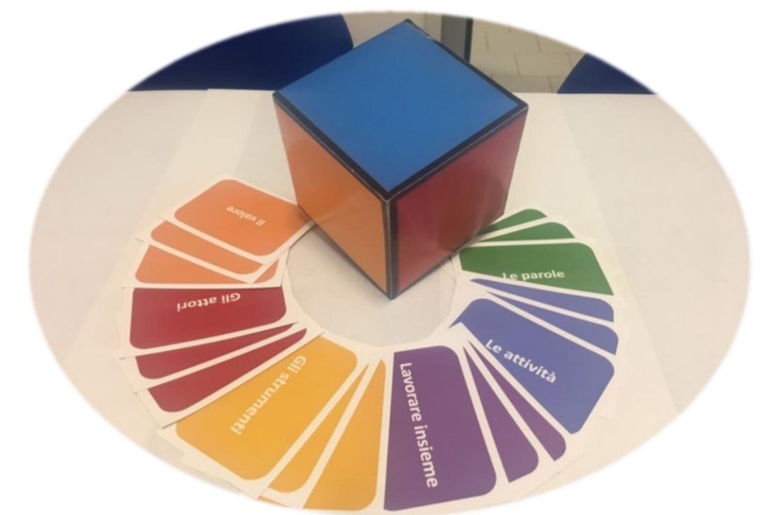
Figure 2. Dice and cards