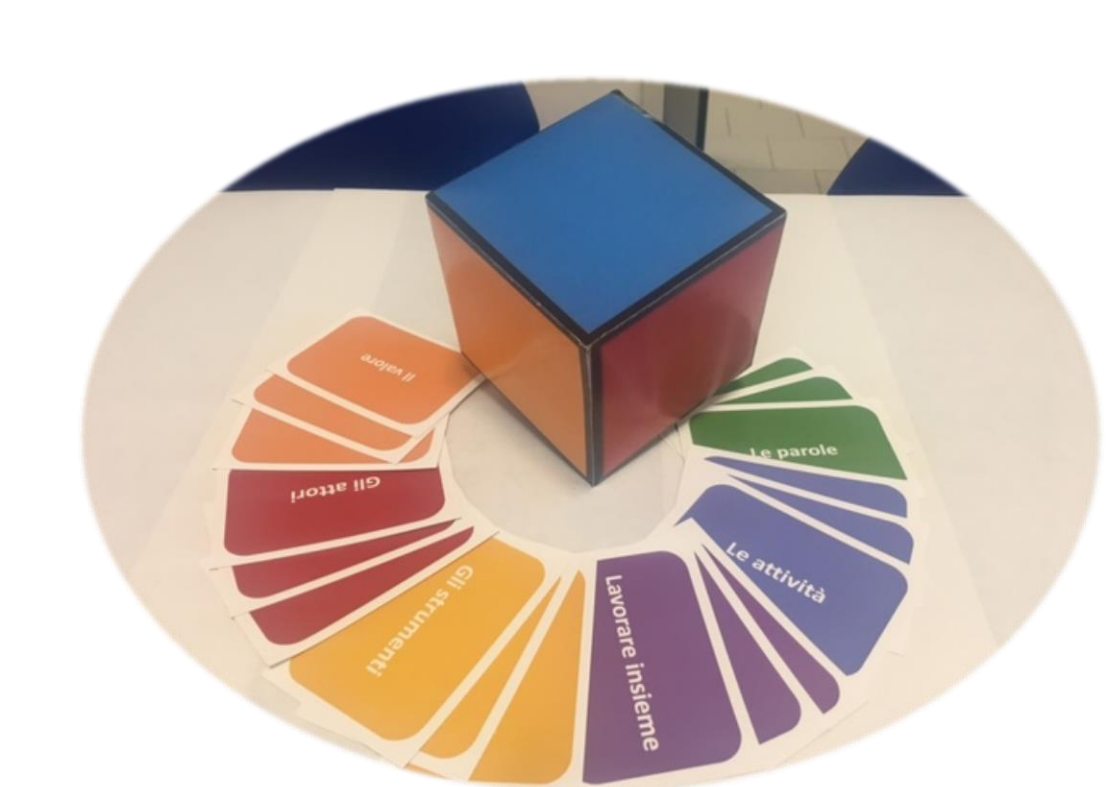
Figure 2. Dice and cards

Getting in the game, the cards, gathered by the six topics represented by diverse colours, were chosen by the player(s) by rolling the dice. Each card included a question on the relevant topic with three alternative answers of which only one was the correct answer.